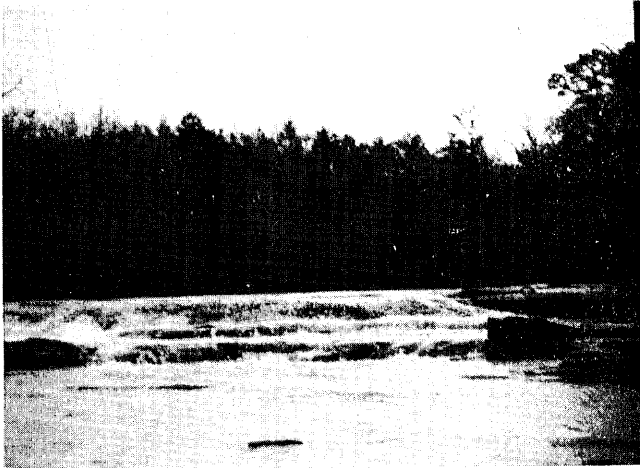
Big Ledge on Lazer Creek